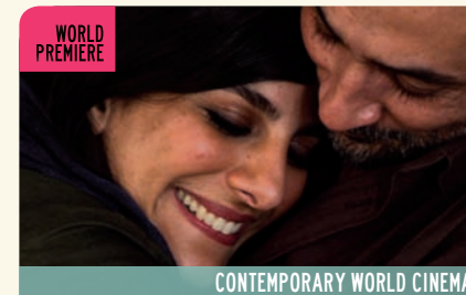
CONTEMPORARY WORLD CINEMA

09/07 1:15PM (V1/P&I). 09/08 9:00PM (V2/PS). 09/10 9:00PM (V1/PS). 09/11 4:30PM (V1/P&I). 09/12 4:45PM (V2/PS)