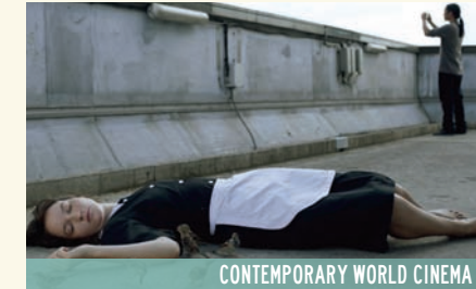
CONTEMPORARY WORLD CINEMA

09/07 2:00PM (V1/P&I), 09/09 1:15PM (V1/P&I), 09/09 9:00PM (V7/PS), 09/13 3:00PM (V7/PS)