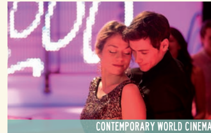
CONTEMPORARY WORLD CINEMA

09/06 11:15AM (V1/P&I). 09/08 7:00PM (V2/PS). 09/09 7:00PM (V6/PS). 09/11 5:45PM (V4/PS)